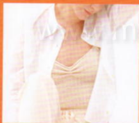
● 衬衫 SHIRT