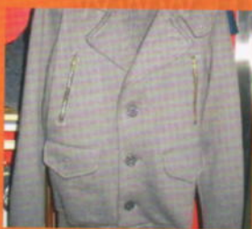
● 夹克 JACKET